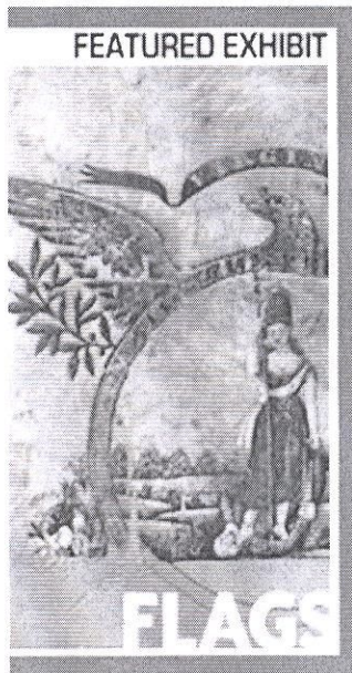
Symbols in Battle A CIVIL WAR FLAGS IN NPS COLLECTIONS